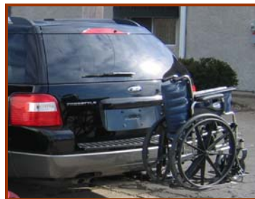
Model 001L Tilt 'N' Tote