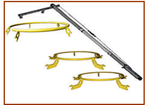
ShotMatic R 2 Rim Reducer, (2) ShotMatic R 3 Rebound Trainers and Post Up Pole