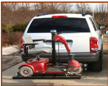
Model 210 Lift 'N' Go