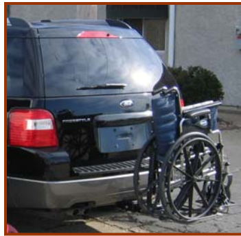
Model 001L Tilt 'N' Tote

We look forward to an exciting and successful 2006! Visit us on the web at www.WheelChairCarrier.com