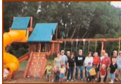
Completed Children's Play Area Hospice of Northwest Ohio Project

At Lockrey we are proud of our community service program. For the last 4 years we have allocated 5% of our bonus toward community service activities. We have been fortunate to contribute approximately $120,000 to our community service program during this period. Every one of our associates is involved. Nominations for