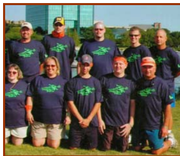
Team Lockrey at the 2005 Dragon Boat Race