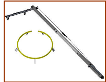
The Home Court Advantage

The start of March signals the beginning of AAU Basketball Tournaments and the beginning of what should be a very successful and busy season for Competitor's Edge. For more information or to place an order online, please visit www.CompetitorsEdge.Net