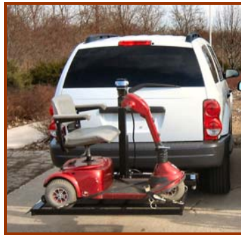
Model 210 Lift 'N' Go